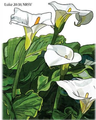
Luke 20:38, NRSV