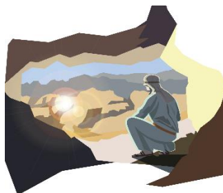
God Speaks to Elijah

12 And after the earthquake a fire, but the LORD was not in the fire. And after the fire the sound of a low whisper. 13 And when Elijah heard it, he wrapped his face in his cloak and went out and stood at the entrance of the cave. And behold, there