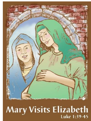
Mary Visits Elizabeth

In those days Mary arose and went with haste into the hill country, to a town in Judah, 40 and she entered the house of Zechariah and greeted Elizabeth. 41 And when Elizabeth heard the greeting of Mary, the baby leaped in her womb. And Elizabeth was filled with the Holy Spirit, 42 and she exclaimed with a loud cry, "Blessed are you among women, and blessed is the fruit of your womb! 43 And why is this granted to me that the mother of my Lord should come to me? 44 For behold, when the sound of your greeting came to my ears, the baby in my womb leaped for joy. 45 And blessed is she who believed that there would be a fulfillment of what was spoken to her from the Lord." 46 And Mary said, "My soul magnifies the Lord, 47 and my spirit rejoices in God my Savior, 48 for he has looked on the humble estate of his servant. For behold, from now on all generations will call me blessed; 49 for he who is mighty has done great things for me, and holy is his name. 50 And his mercy is for those who fear him