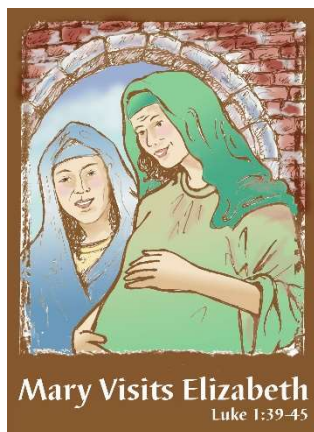
Mary Visits Elizabeth Luke 1:39-45

and she entered the house of Zechariah and greeted Elizabeth. 41 And when Elizabeth heard the greeting of Mary, the baby leaped in her womb. And Elizabeth was filled with the Holy Spirit, 42 and she exclaimed with a loud cry, "Blessed are you among women, and blessed is the fruit of your womb! 43 And why is this granted to me that the mother of my Lord should come to me? 44 For behold, when the sound of your greeting came to my ears, the baby in my womb leaped for joy. 45 And blessed is she who believed that there would be a fulfillment of what was spoken to her from the Lord." 46 And Mary said, "My soul magnifies the Lord, 47 and my spirit rejoices in God my Savior, 48 for he has looked on the humble estate of his servant. For behold, from now on all generations will call me blessed; 49 for he who is mighty has done great things for me, and holy is his name. 50 And his mercy is for those who fear him