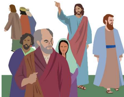
Jesus Sends Out His Disciples