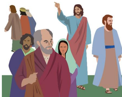
Jesus Sends Out His Disciples