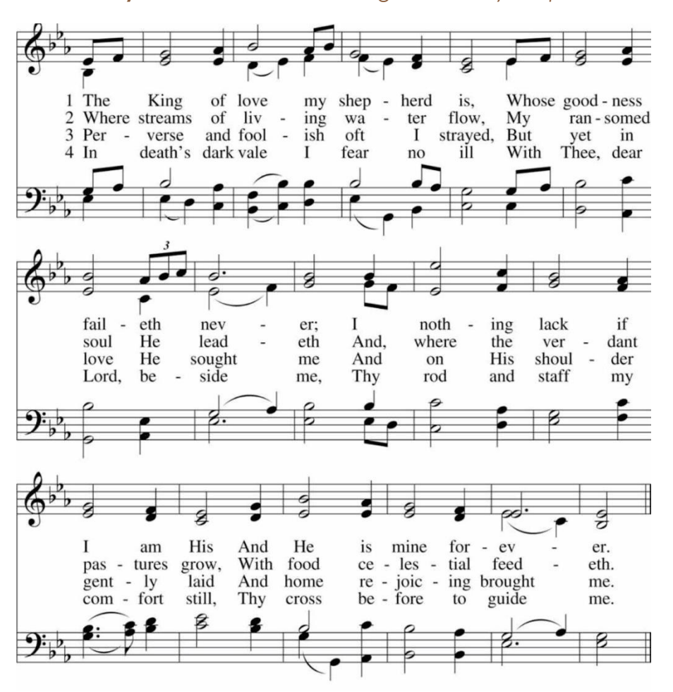
5. And so through all the length of days Thy goodness faileth never; Good Shepherd, May I sing Thy praise Within Thy house forever!